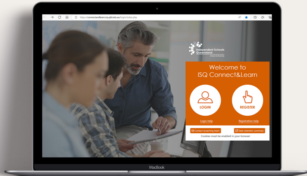
IMAGE: ISQ's online learning platform, Connect&Learn