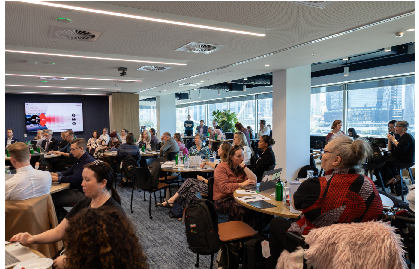
IMAGES: 2025 Schools Marketing and Communications networking events 31 March (top) and 28 October (bottom)

ISQ continued to deliver high-quality member services by hosting events including the Schools Marketing and Communications networking events, media training sessions, and emergency management communications and media issues management training delivered through the New Business Managers Forum and New Principals Program. In 2025, two networking events were held on 31 March and 28 October at ISQ South Bank, attracting more than 120 attendees across both sessions. ISQ also maintained consistent communication with members through marketing and communications updates and the ISQ Marcomms Facebook group during the 2025 reporting year.