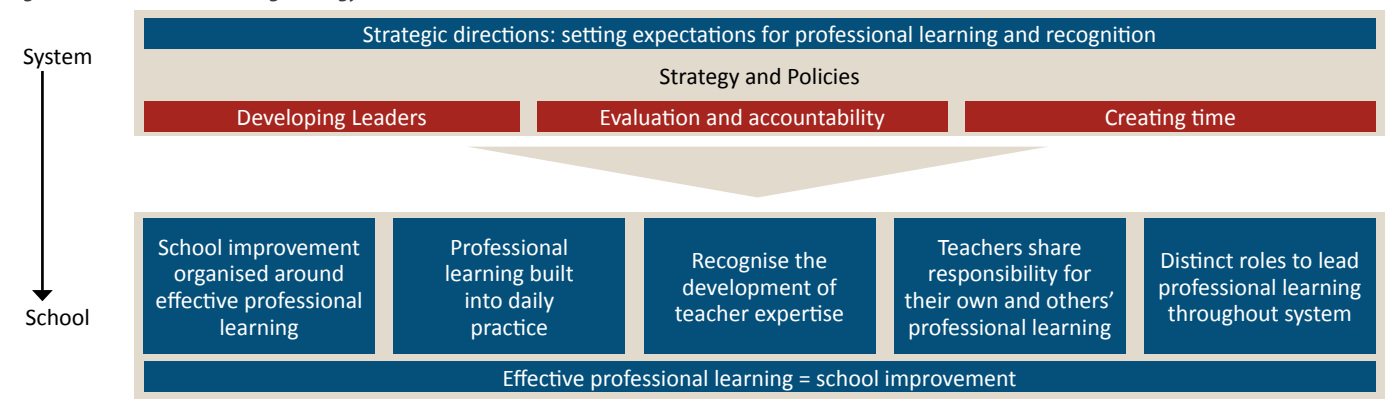
Figure 1: Professional Learning Strategy