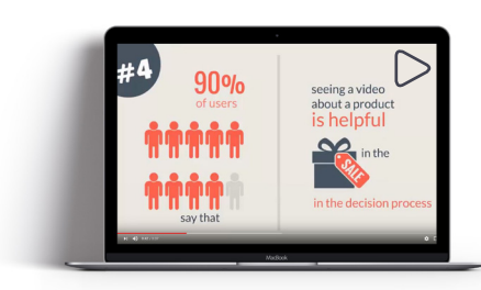
Figure 3 – Top 10 Video Marketing Stats