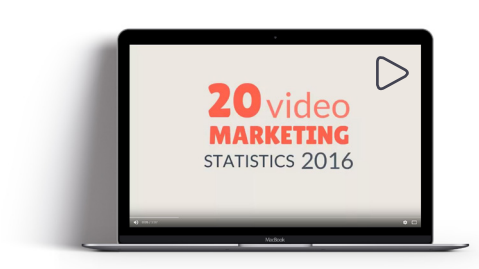
Video 1 – YouTube Statistics 2016

Video marketing is taking branding to another level, it has never been easier to engage with your market and build an audience. With statistics like those from YouTube it is easy to see why.