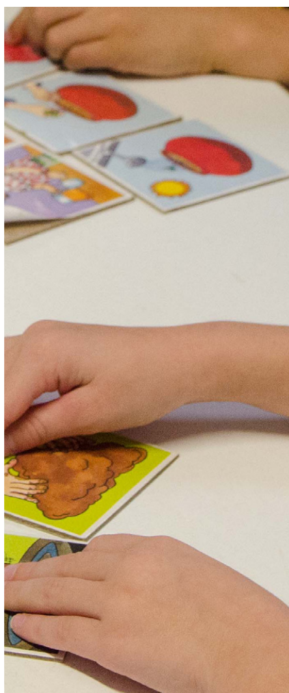
Images, clockwise from above: Mueller College; The Spot Academy; The Glenleighden School. Cover: Djarragun College.