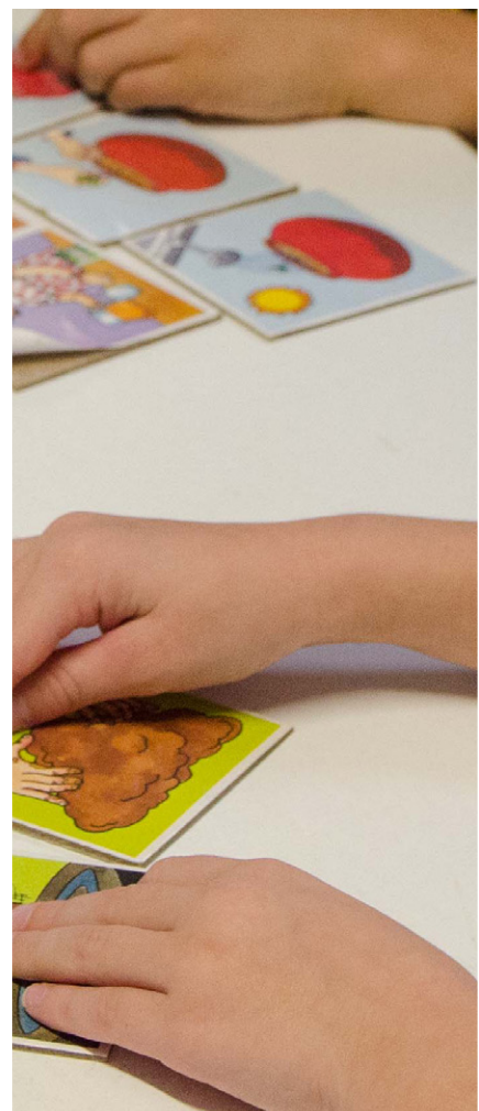
Images, clockwise from above: Mueller College; The Spot Academy; The Glenleighden School. Cover: Djarragun College.